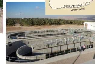
Jericho wastewater treatment facility