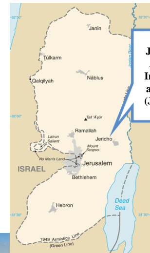
Jericho Agro-Industrial Park (JAIP)