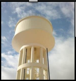
Elevated water tank (Funded by Japan)