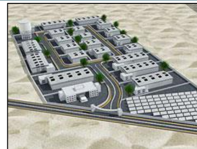
JAIP image after completion