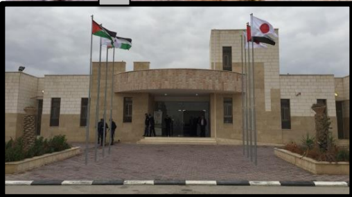
Administration building (Funded by Japan)