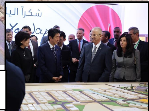
Visit by Prime Minister Abe (2018.5.2)