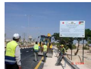
Road construction in Jericho city